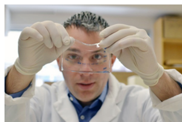
WHRY-Funded Investigator Reducing the Confusion In Genetic Testing for Breast Cancer Risk