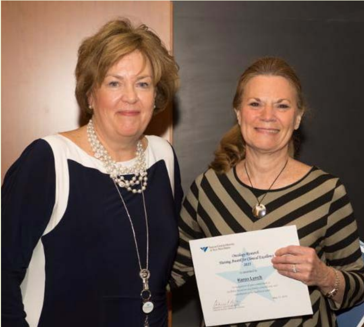
Karen Lynch Nursing Award for Clinical Excellence